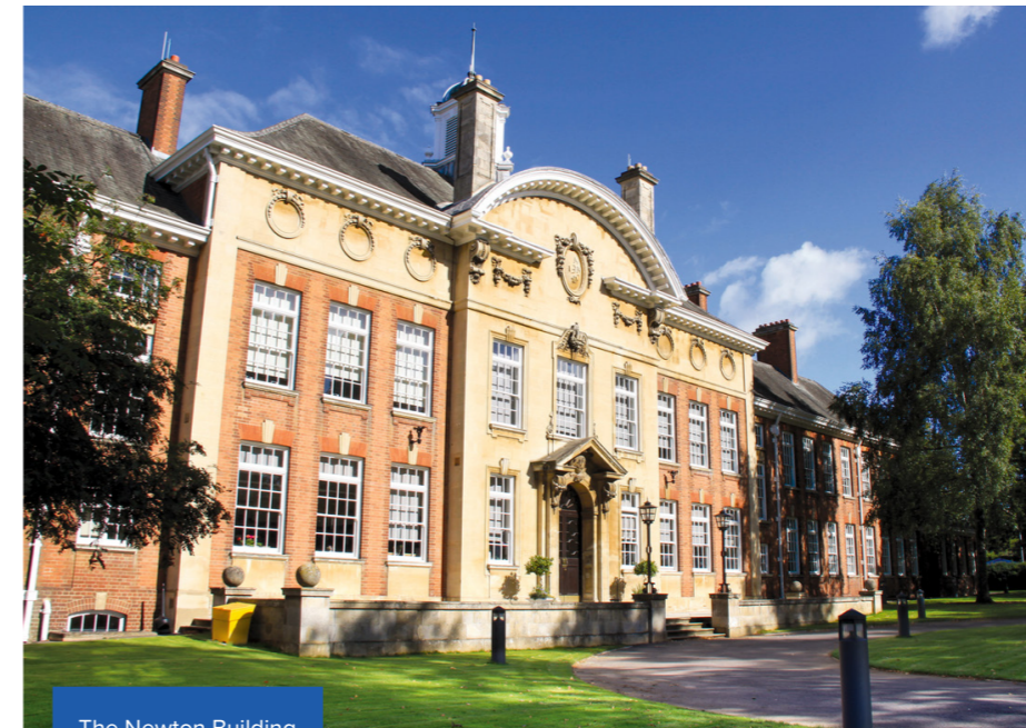
The Newton Building - Bosworth school features excellent facilities throughout

WEB: STUDYHOLIDAYS.COM | EMAIL: RESERVATIONS@STAFFORDHOUSE.COM | PHONE: +44 (0) 1227 787 730