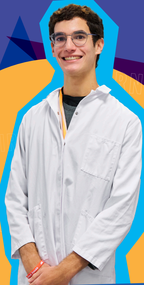
LUCA CHOSE STEM